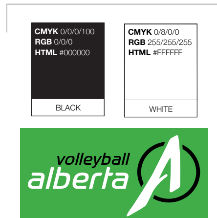
Corporate Reverse Option