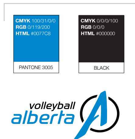
Corporate Colours on WHITE